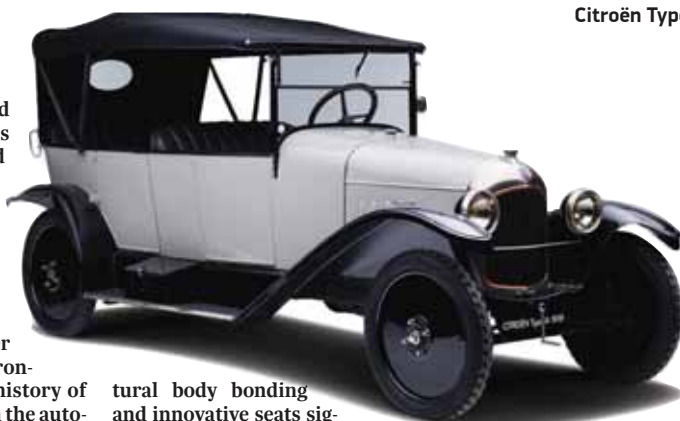
Citroën Type A

The recent launch of New C5 X and New C5 Aircross SUV reiterates the brand's vision to find a perfect filtration of the road, like being on a magic carpet. The Citroën Advanced Comfort® programme ensures that comfort remains a key element in the brand DNA, with Progressive Hydraulic Cushions®, struc-