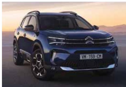
Citroën C5 Aircross SUV