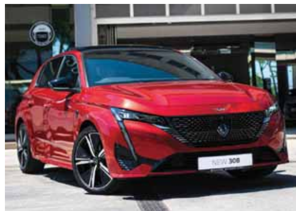
Peugeot 308, now at the Peugeot showroom in Blata l-Bajda.

expanding line-up of new electrified powertrains in both passenger cars and light commercial vehicles. These LCV vehicles were designed as part of a cross-business program and offer payloads and loading volumes without compromise. They benefit from a new generation of technologies and assistance systems, security and comfort. We understand you might have a few questions about vehicles and electrification, therefore we encourage you to contact us, and our team will be more than happy to discuss your requirements. For further details find Michael Attard Ltd on social media or visit www.michaelattard.com .