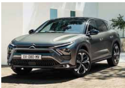
Citroën C5 X