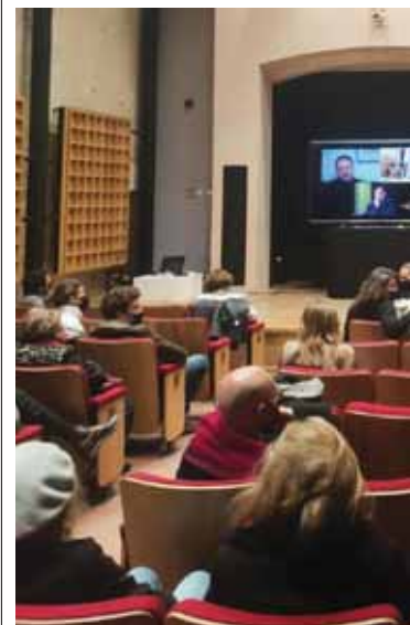
Night of Ideas