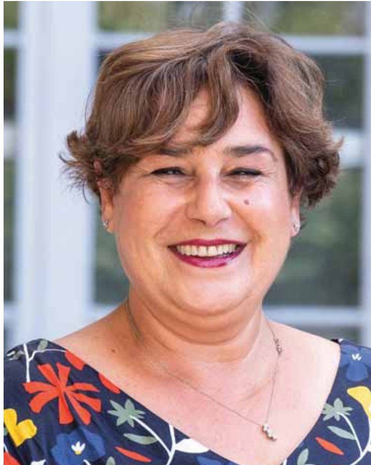
Agnès von der Mühll, Ambassador of France to Malta.

The EU has welcomed more than 7.6 million Ukrainian women and men, supported the Ukrainian army with the deployment of unprecedented military